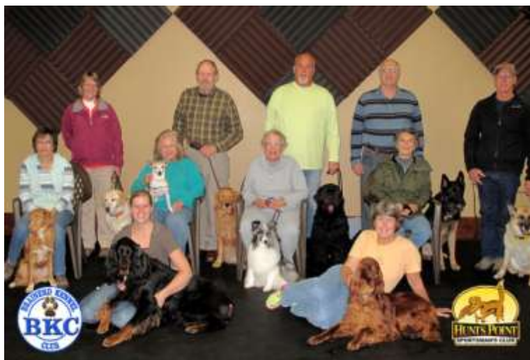
First CGCA graduates in AKC history, on October 1, 2013

Dog Lovers Word Search This month the Gordon Setter